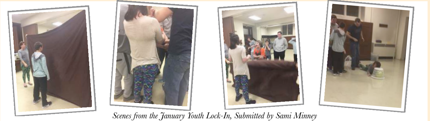
Scenes from the January Youth Lock-In, Submitted by Sami Minney